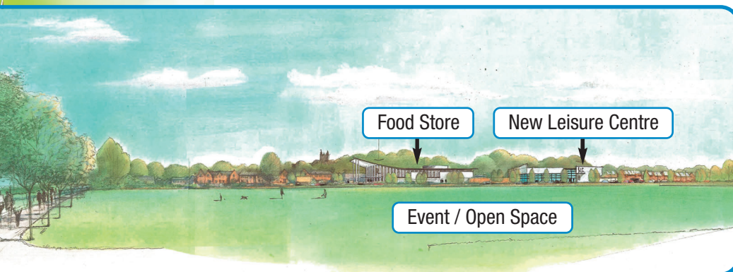
Artist's impression looking into the proposed Westbridge Park

As part of this consultation, The Borough Council is asking if local residents would be prepared to see a new food store in a town centre, council-owned site, if it helps fund new leisure facilities and improvements to Westbridge Park.